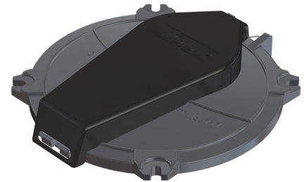
HWC454Z shown on SH451 series swing hatch

The HWC454Z is generally used in Aviation applications or where water ingress could be detrimental.